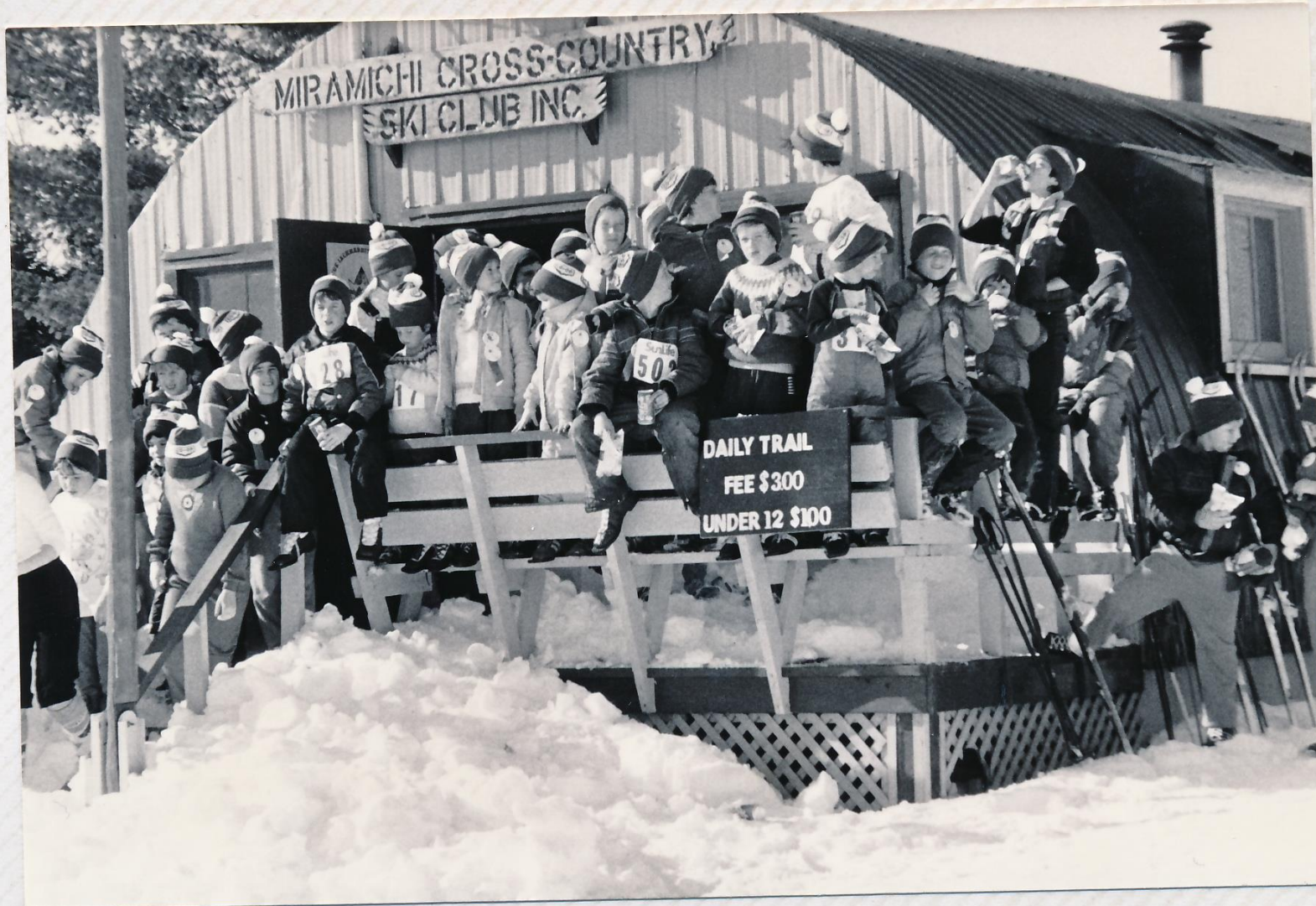
Jackrabbits at Meese Douglas town, N.B. 1986-1987