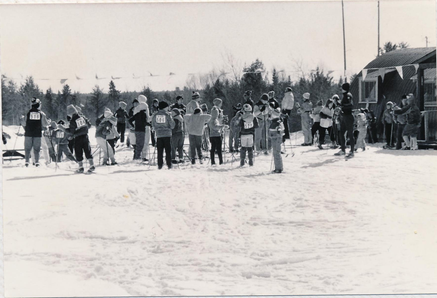
Douglastown, N.B. 1986-1987