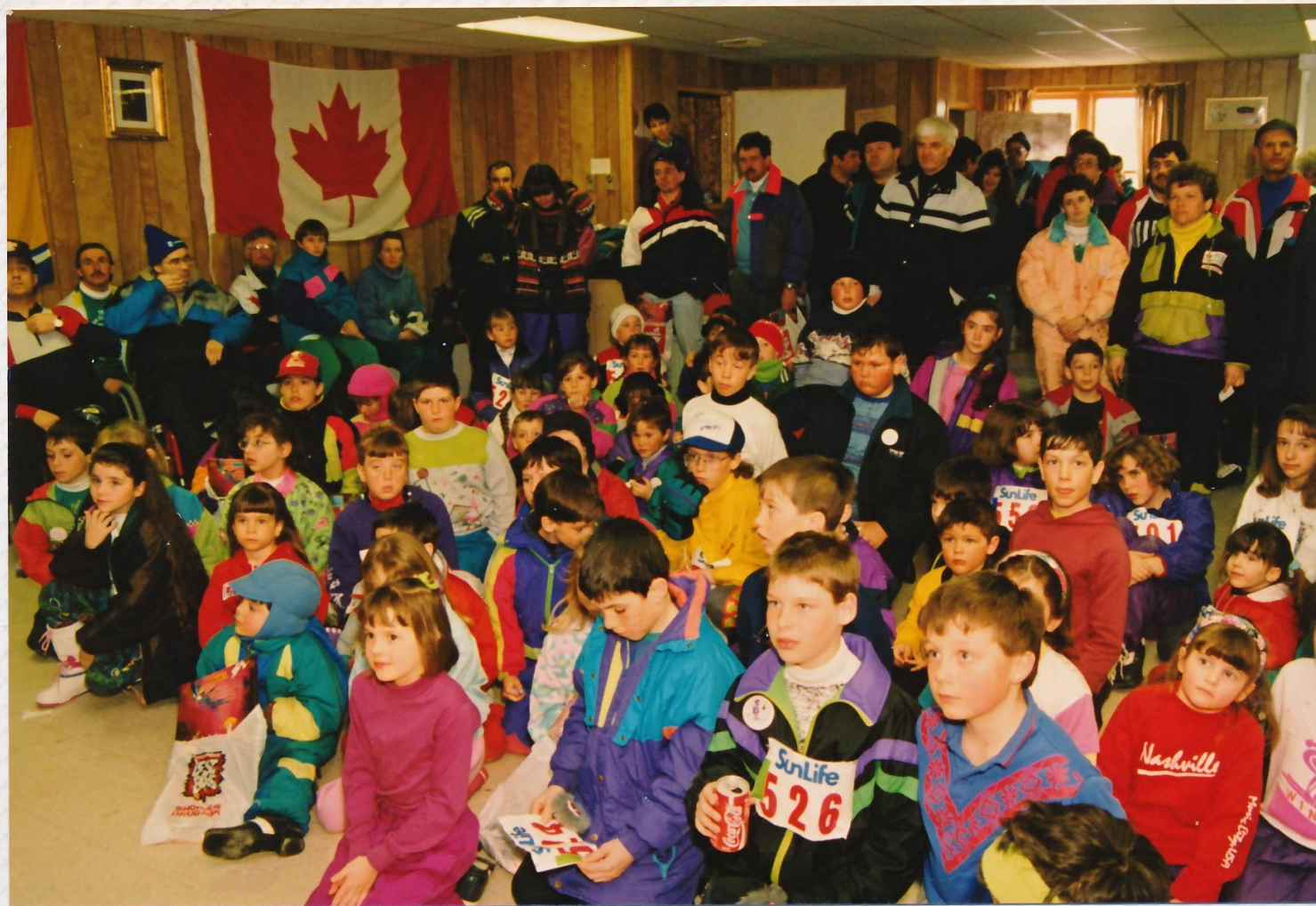
Medal presentation after marathon. Kids from Miramichi club & club from Portage River March 1992.