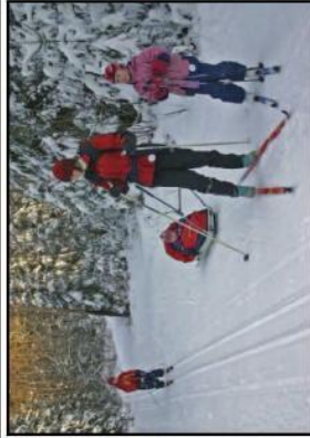
Young family with child being towed in a PULK

Cross Country Skiing provides the best exercise of any activity, in terms of cardiovascular health and overall fitness. Yet it can have a low impact on muscles and joints and participants can be active at an intensity level they are comfortable with. With fresh air in bright sunshine or by moonlight in a winter wonderland, it can make winter worth waiting for.