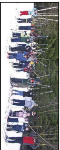
JACKRABBIT SKIING LESSON

The MCCSC is affiliated with Cross Country New Brunswick And Cross Country Canada