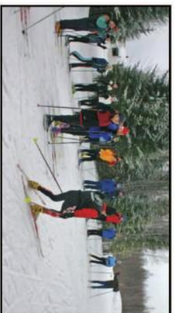
SKATE SKIING CLINIC